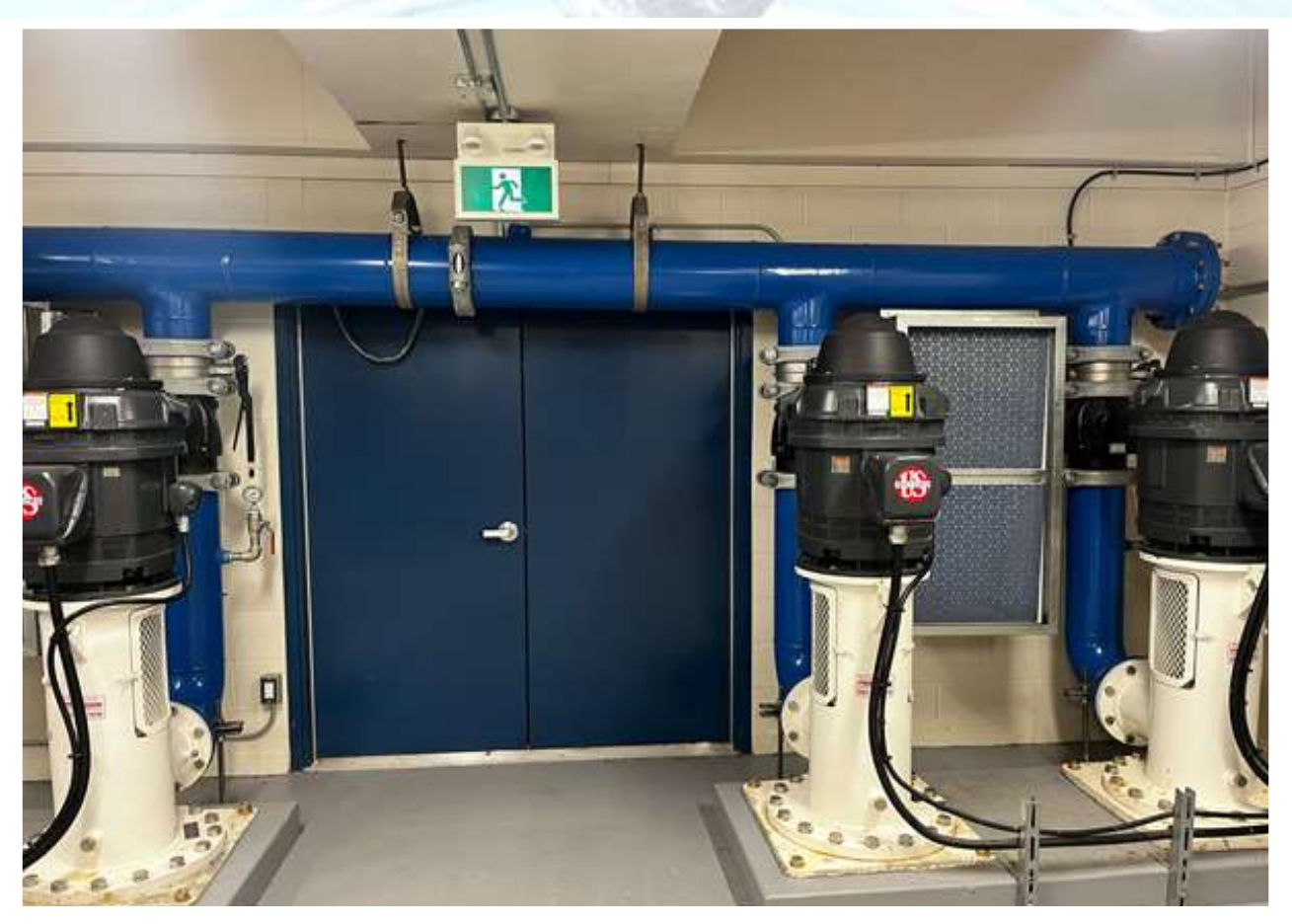
Schikurski Park Booster Station

63 kilometers of water main interconnect the Town reservoirs to the community. 3056 residential connections and 239 commercial/industrial connections ensure that the Town population of 5583 (2021 Census) have unrestricted access to the Town water supply.