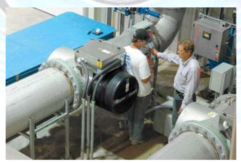
Arrow Creek Ultra Violet Disinfection Equipment

Although the water system was first developed in 1929, unsafe water quality issues due to the inadequate treatment processes resulted in a new water treatment plant being commissioned on Arrow Creek in 2005. The $9.3 million treatment process includes coarse screening, settling, fine screening, membrane filtration, UV disinfection, and residual disinfection by chlorination.